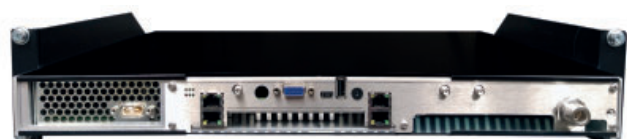
DTA7000 single carrier with slide guides for cabinet (rear view)