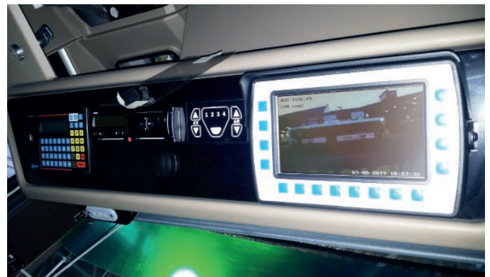
On-board equipment's inside driver cockpit (positioned on top driver seat)