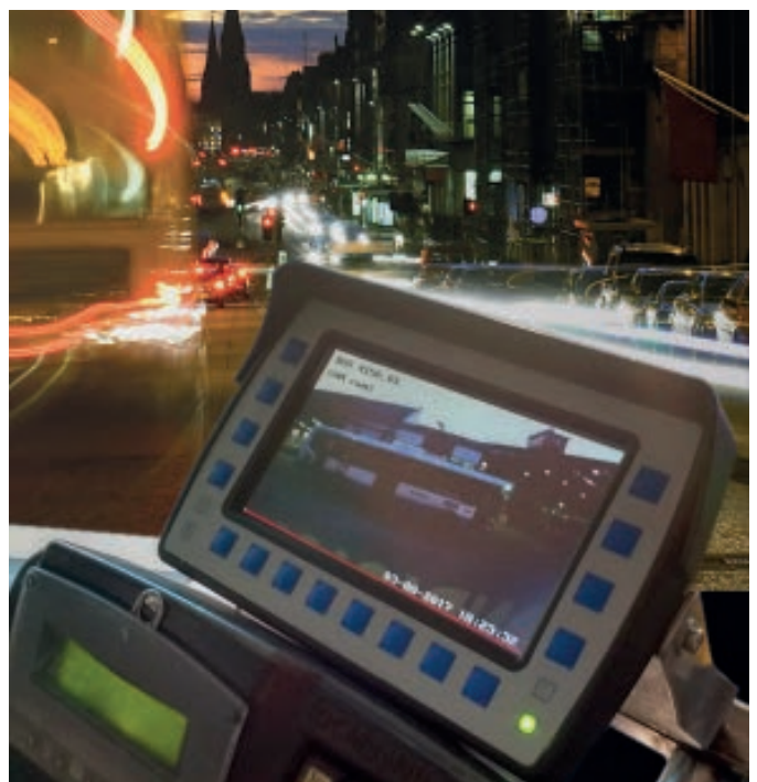
On-board Operator panel

In cooperation with the eNOBU or providing a compact-entry level alternative.