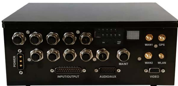
On-board unit [eNOBU]

eNOBU has compliancy with railway and automotive standards and joins Information Technology for Public Transport (ITxPT) specification