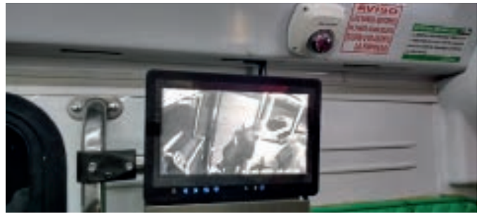
Videosurveillance on-board camera

eNOBU can enable on-board video surveillance features controlling video cameras, video recorder and optional real-time streaming to control Centre. Internal events (speed limits, malfunctions, etc.), as well as driver generated events and alarms, can be automatically sent to the Control Centre. Bus path deviation events can be monitored as well. Information collected by eNOBU can be remotely managed by Leonardo SC2, the platform specifically designed for Situation Awareness and Resilience, able to support security control room operators in an efficient management of ordinary and critical situations.