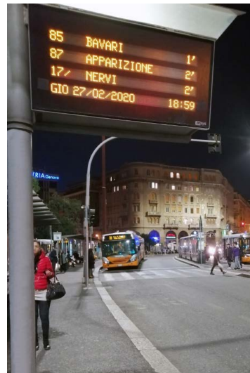
Electronic smart bus-stop

AVM App for Bus Customers can provide forecasts provided by AVM Central System, the positions on the buses. And information about the ongoing service. AVM App is available for Android and IOS.