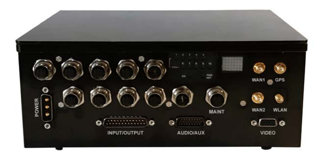
On-board unit [eNOBU]

eNOBU has compliancy with railway and automotive standards and joins Information Technology for Public Transport (ITxPT) specification