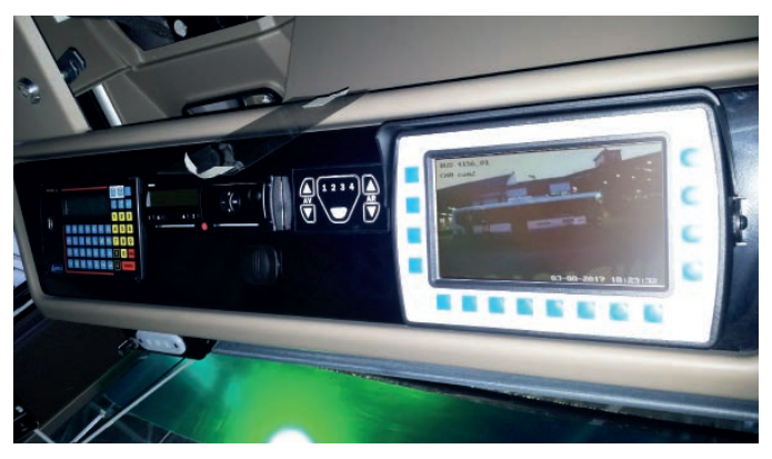
On-board equipment's inside driver cockpit (positioned on top driver seat)