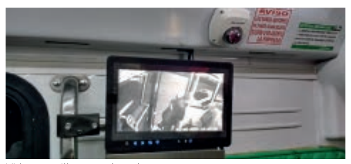
Videosurveillance on-board camera

eNOBU can enable on-board video surveillance features controlling video cameras, video recorder and optional real-time streaming to control Centre. Internal events (speed limits, malfunctions, etc.), as well as driver generated events and alarms, can be automatically sent to the Control Centre. Bus path deviation events can be monitored as well. Information collected by eNOBU can be remotely managed by Leonardo SC2, the platform specifically designed for Situation Awareness and Resilience, able to support security control room operators in an efficient management of ordinary and critical situations.