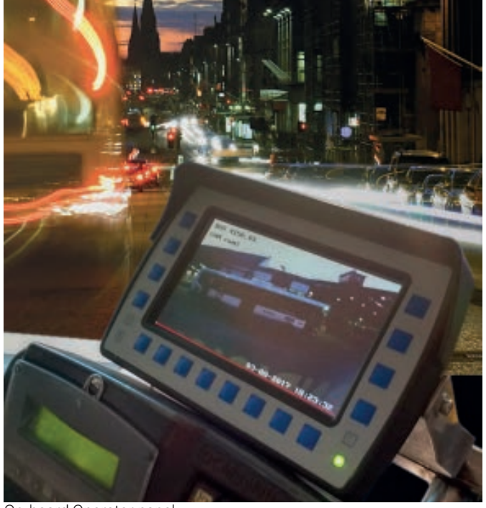
On-board Operator panel

In cooperation with the eNOBU or providing a compact-entry level alternative.