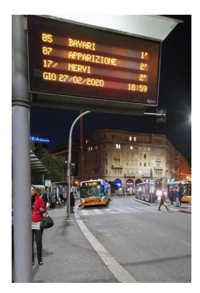
Electronic smart bus-stop

AVM App for Bus Customers can provide forecasts provided by AVM Central System, the positions on the buses. And information about the ongoing service. AVM App is available for Android and IOS.