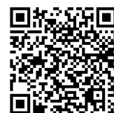
← PUMA-T4 TLE model

For more information please email: securityandinformation@leonardocompany.com