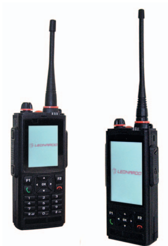
PUMA-T4 TK model →