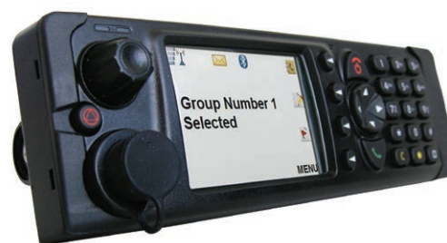
Front panel (FPG3 Plus)