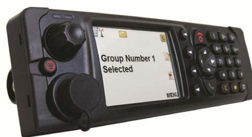
Front panel (FPG3 Plus)