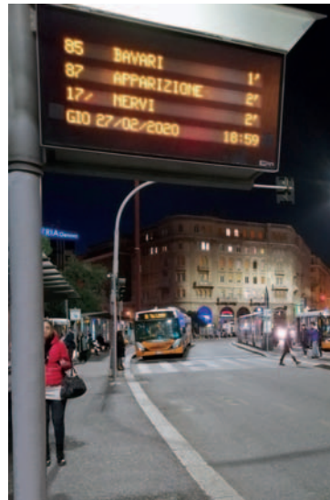
Electronic smart bus-stop

AVM App for Bus Customers can provide forecasts provided by AVM Central System, the positions on the buses. And information about the ongoing service. AVM App is available for Android and IOS.