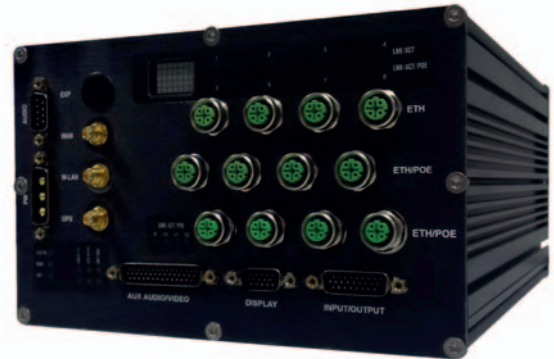
On-board unit [NoBU]

In cooperation with the NOBU or providing a compact-entry level alternative.