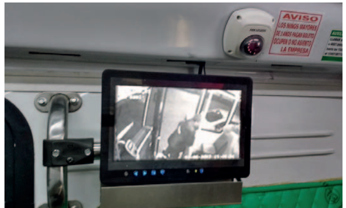
Videosurveillance on-board camera