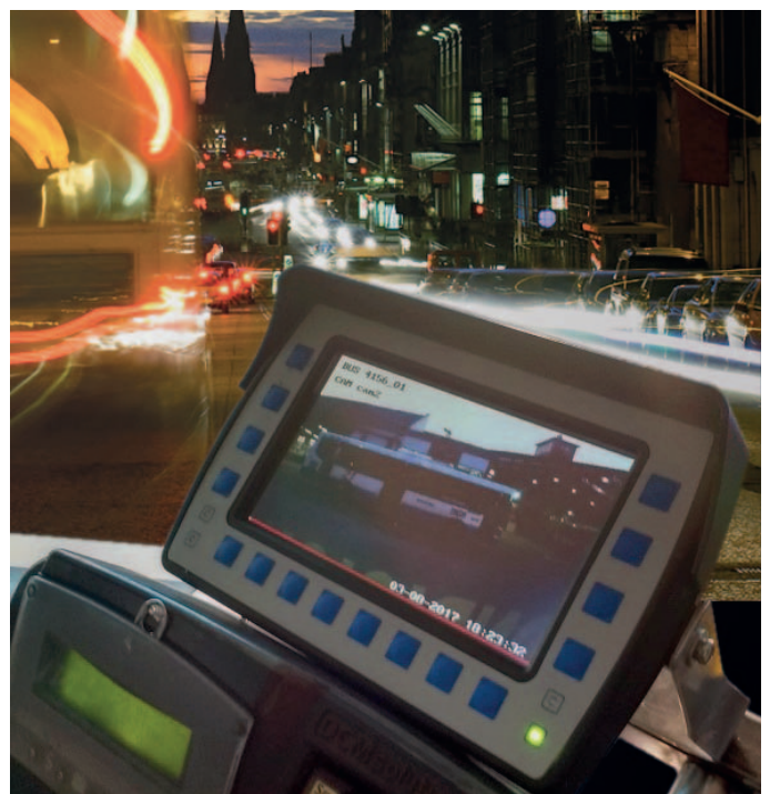
On-board Operator panel