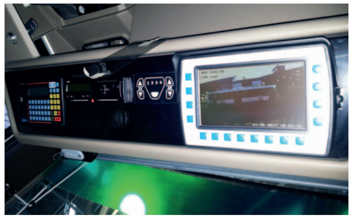
On-board equipment's inside driver cockpit (positioned on top driver seat)